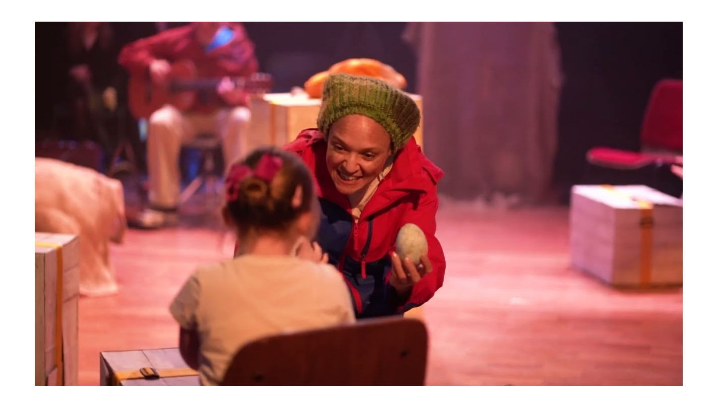
Trailer - https://www.youtube.com/watch?v=JSPSo_9kKxY